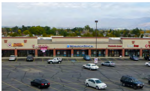
Smiths Grocery Center Retail - 80,812 SF

4700 South 4000 West, West Valley City, UT