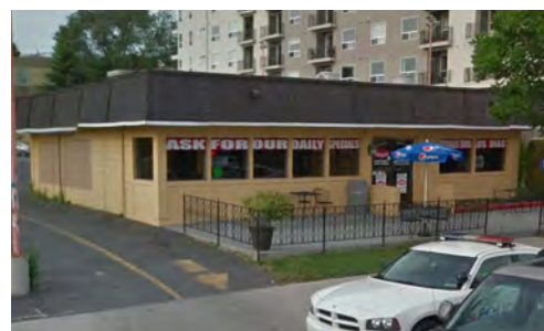
Mezquite Restaurant Retail - 2,274 SF

4561 South 4000 West, West Valley City, UT