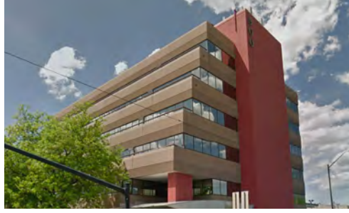
500 South Building Office - 62,014 SF