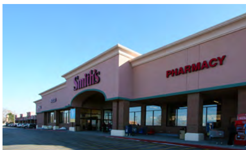
Smiths Center - West Bench Retail - 110,000 SF

979, 1025, and 1235 S. University Ave, Provo, UT