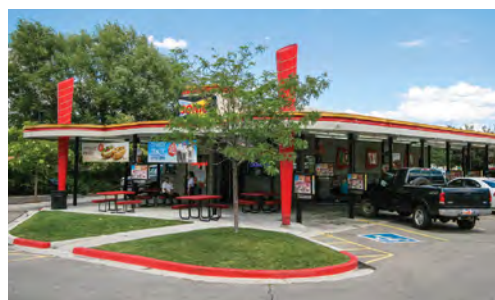
Sonic Drive-In - Retail 2,480 SF

4561 South 4000 West, West Valley City, UT