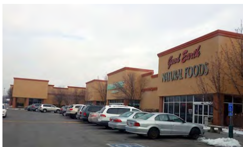
East Bay Shopping Center Retail - 172,573 SF

979, 1025, and 1235 S. University Ave, Provo, UT