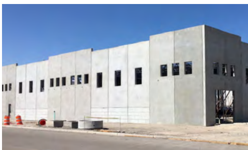
Lakeview Warehouse - Industrial 38,534 SF