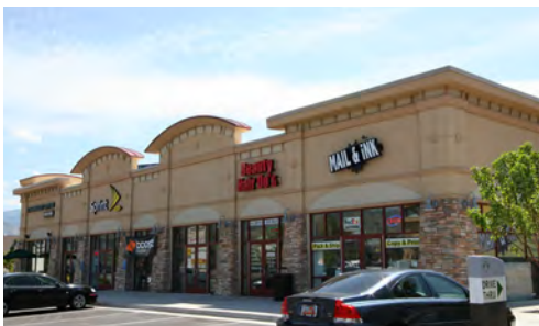
Marketplace at 18th Retail - 39,300 SF 1830 South 300 West, Salt Lake City, UT