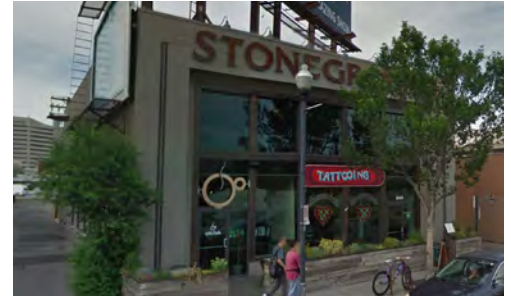
Stoneground Building Office / Retail - 9,800 SF