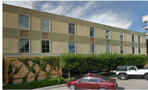
Denver Street Office - 16,800 SF