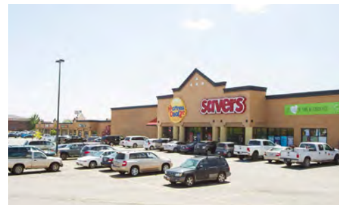
Layton Shopping Center Retail - 63,747 SF

4700 South 4000 West, West Valley City, UT