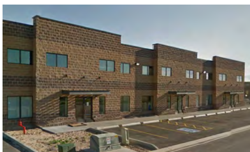
North Spring Business Park Industrial / Retail - 54,180 SF

517 & 555 West 100 North, Providence, UT