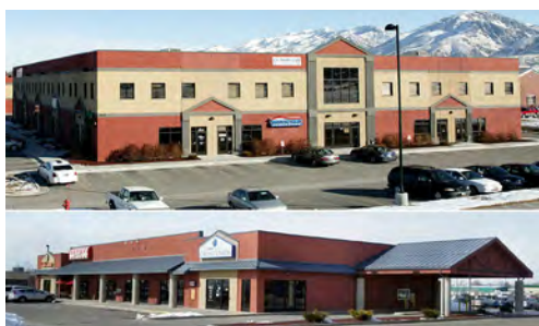
Spring Creek Village Office / Retail - 64,755 SF

517 & 555 West 100 North, Providence, UT