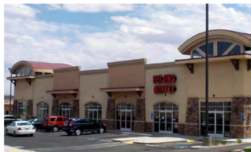
Bluff St. Market Place Retail - 9,200 SF 987 South Bluff Street, St. George, UT