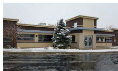
North Ogden Restaurant - Retail 3,014 SF