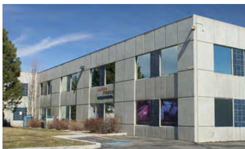
Sandy Industrial - Industrial 22,870 SF