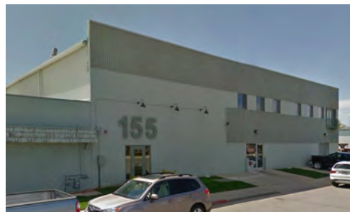
Malvern Office / Industrial - 35,102 SF 155 West Malvern Avenue, Salt Lake City, UT