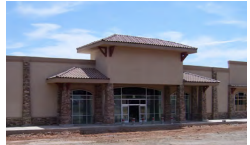
Staples Retail - 43,000 SF 963 South Bluff Street, St. George, UT