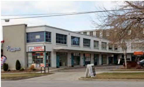
Ray Building Office / Retail - 22,100 SF