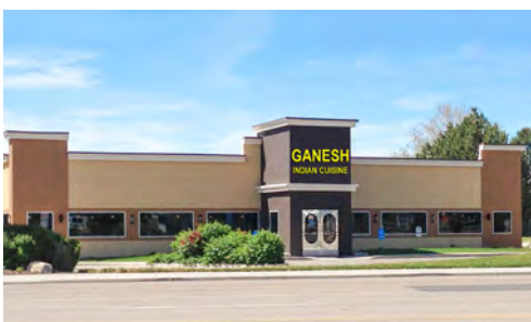
Ganesh Indian Cuisine Retail - 2,886 SF 784 East State Street, American Fork, UT