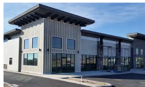
Monte Vista - Retail 6,000 SF

1388 Eagle Mountain Blvd, Eagle Mountain, UT