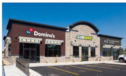
The Shops at Redwood - Retail 5,375 SF

1388 Eagle Mountain Blvd, Eagle Mountain, UT