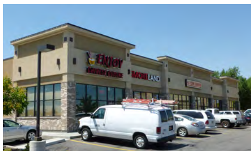
Jordan Village - Retail 20,017 SF