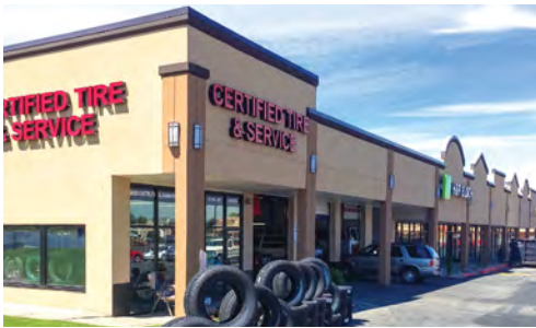
Ridley's Shopping Center Retail - 73,816 SF 1500 North State Street, Orem, UT