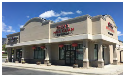
Brigham Plaza- Retail 3,960 SF