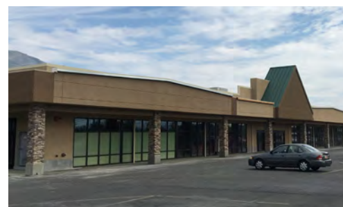
Freedom Center - Retail 40,725 SF

3560 North Main Street, Spanish Fork, UT