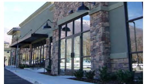
Lindon Marketplace Retail - 10,900 SF 550 North State Street, Lindon, UT