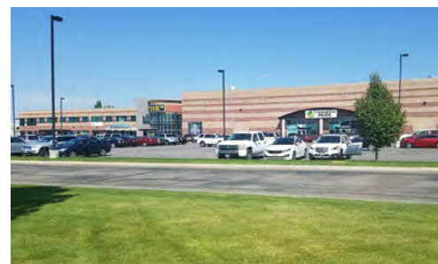
Sportsplex - Kaysville Retail - 106,122 SF