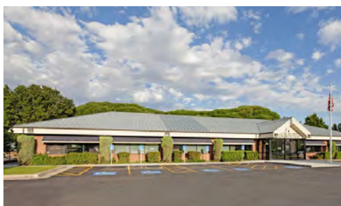
U.S. Social Security Building Office - 10,206 SF

10138 S. Jordan Gateway, South Jordan, UT