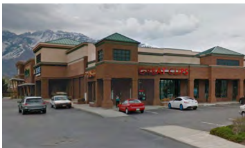
Draper Plaza Retail - 82,000 SF