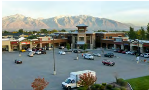
Dixie Valley Center Office / Retail - 43,000 SF 6200 South Bangerter Hwy, West Jordan, UT