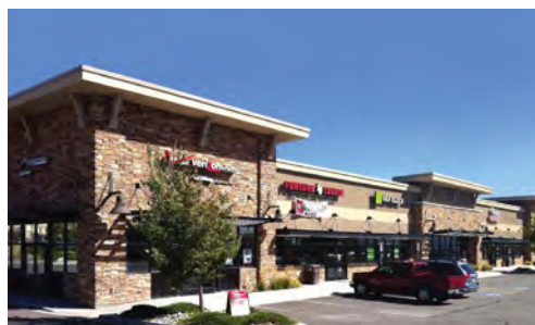
Riverton Retail Shops - Retail 12,680 SF