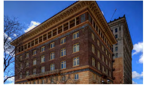
Commercial Club Office / Retail - 61,081 SF