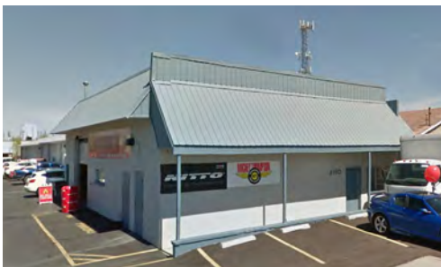
Warehouse Industrial - 10,486 SF 4190 West 2100 South, Salt Lake City, UT