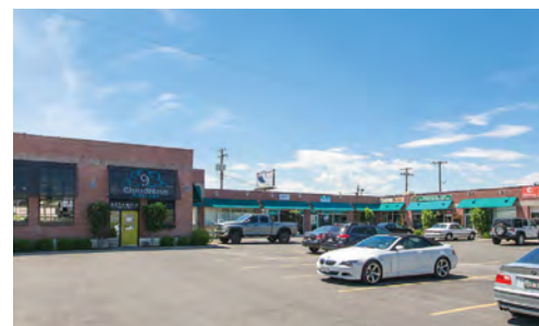
Sugarhouse Office/Retail 21,600 SF