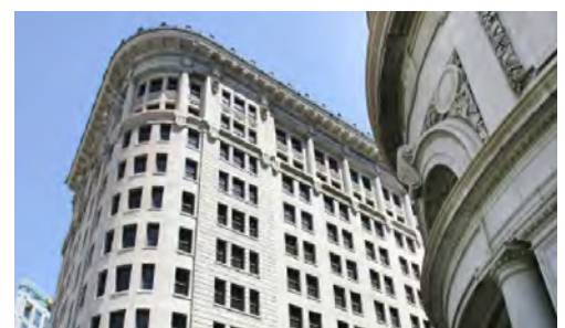
Boston Building Office / Retail - 105,649 SF 9 Exchange Place, Salt Lake City, UT