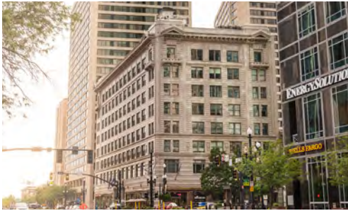
Clift Building Office/Retail - 85,000 SF